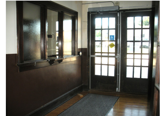
The charming entryway to the main level