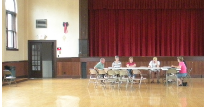
Large or small the Hortonville Community Hall is the perfect fit!

All of these improvements are made possible by the time, talent and treasure of the people and businesses of Hortonville and the surrounding communities. We thank you!