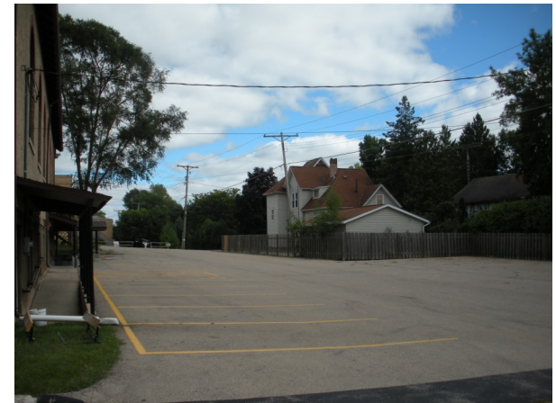
Generous parking is located behind the building.