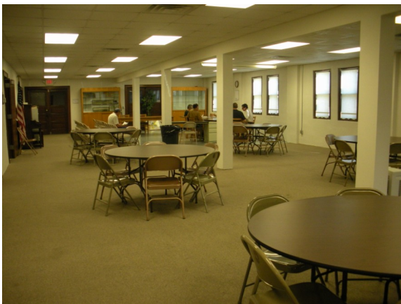
The lower level of the Community Hall boasts a large space for your smaller events.

Did you know that the Community Hall recently had several updates to it? The elevator and handicapped accessible ramps are just one of many improvements made including modern restrooms. The large kitchen in the lower area houses industrial equipment able to feed a crowd. Don't let the traditional cabinetry fool you. This kitchen is ready for your event! Just ask the ladies of the American Legion Auxiliary who host their membership dinners here on a regular basis. There is also parking available behind the building with handicap parking for your event.